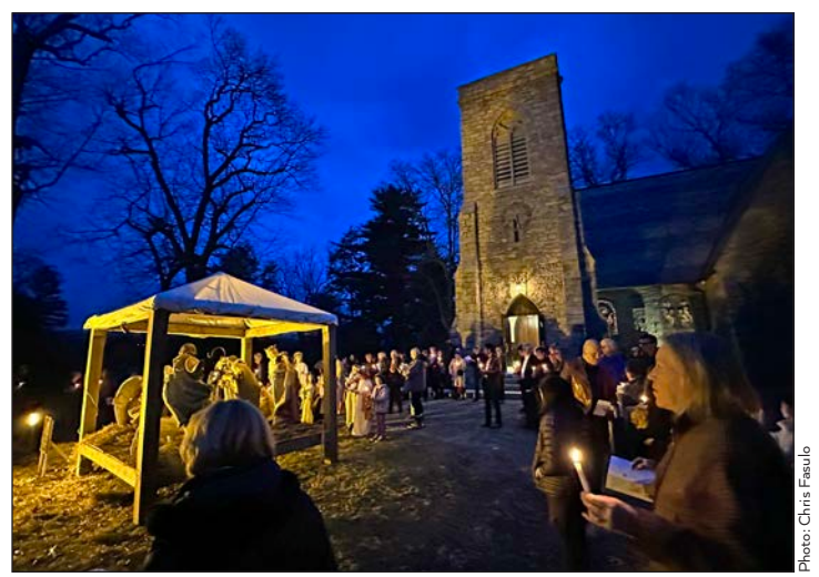
{\it The congregation gathered outside to sing Silent Night at the conclusion of the Christmas Pageant.}

rector@stphilipshighlands.org 845-424-3571