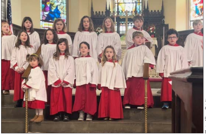
The children's choir performs during the 10 am church service.