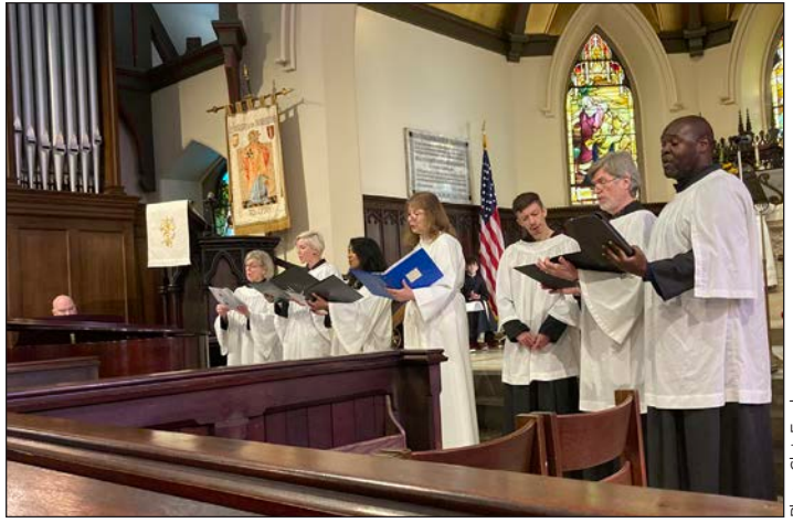
St. Philip's Adult Choir