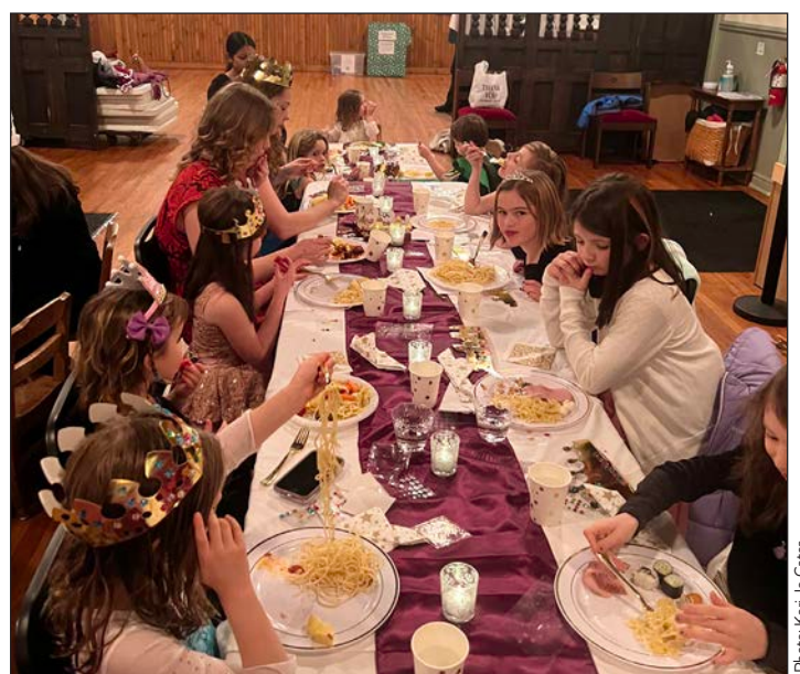
St. Philip's children share a meal at the Annual Epiphany Party.

Our 2024 theme is "Walk in Love". How do we love? We start with each other - our community here at St. Philip's. Supporting one another in our physical, emotional and spiritual needs. We continue to spread that love outside these walls, to our wider community through outreach into our neighborhoods, into our workplace, our cities and into the world.