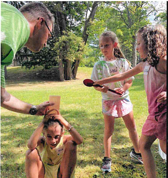
Playing games, staying cool.